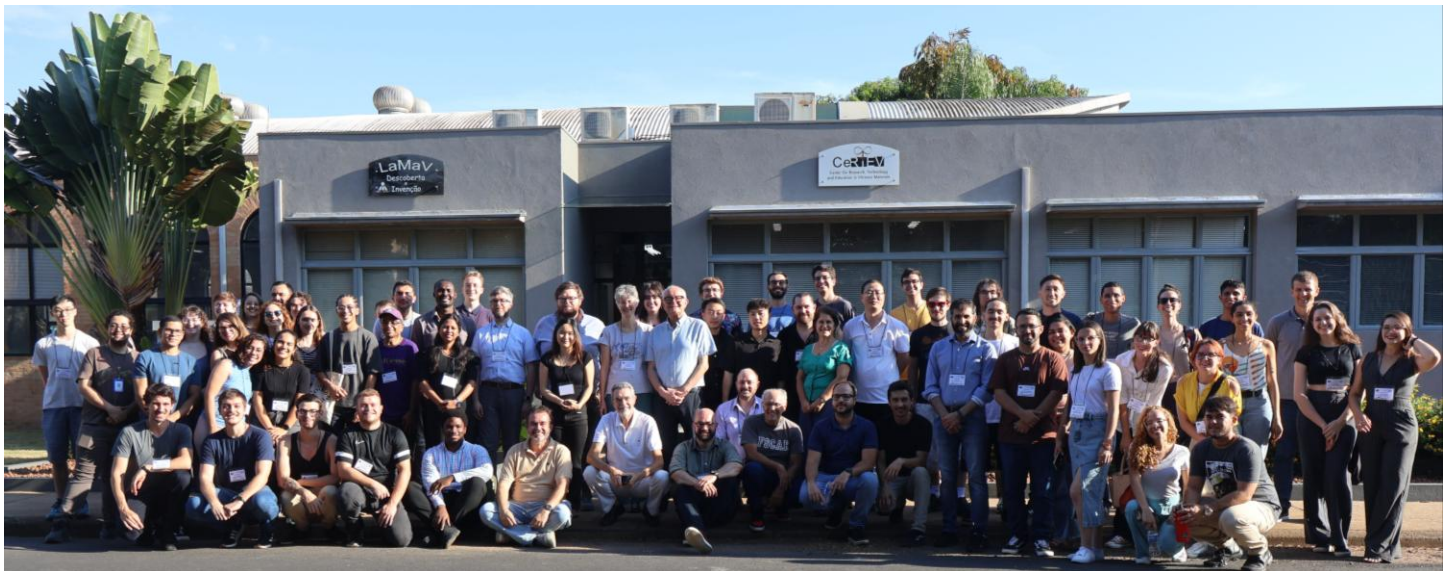
Vitreous Materials Laboratory (LaMaV) ( lamav.weebly.com ). Instructors and participants of the third school (2024).