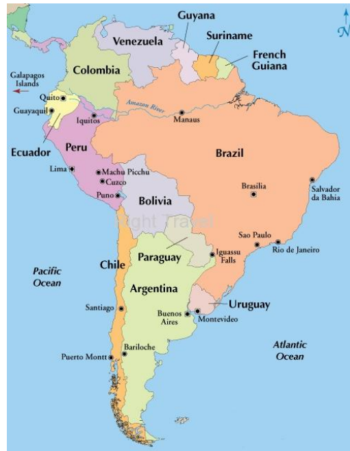
Map of South America.