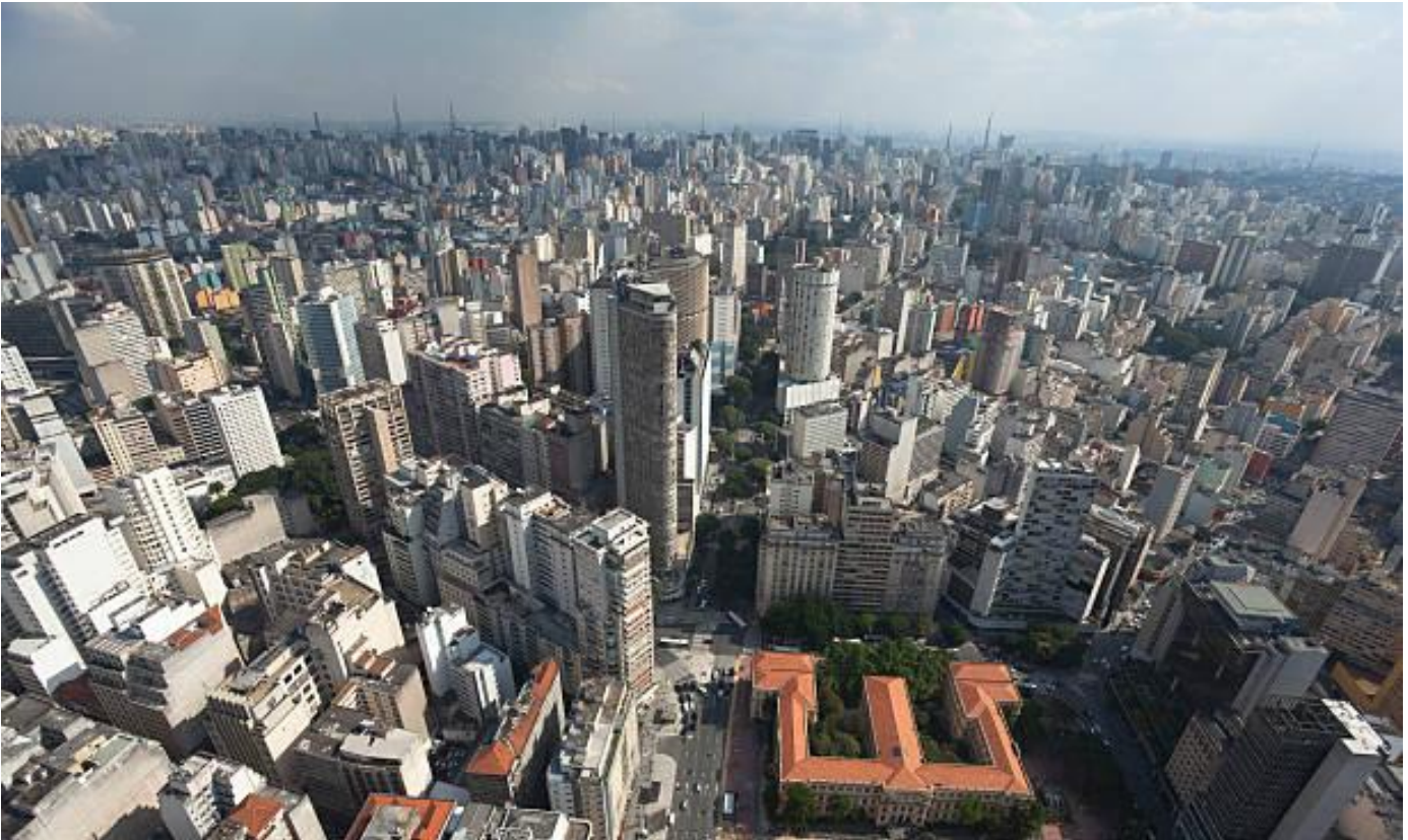
View of São Paulo, Brazil.

The city is also renowned for its spectacular gastronomy, featuring renowned restaurants and vibrant food markets that celebrate international cuisine. The Municipal Market , known for its renowned mortadella sandwich and an enormous variety of fruits, is a must for those looking to explore local flavors. Additionally, São Paulo boasts a vibrant nightlife, featuring bars, concert venues, and theaters that stay open late. The city's cultural diversity is reflected in neighborhoods like Liberdade , known for its strong Japanese influence, and Vila Madalena , famous for its street art and vibrant bars.