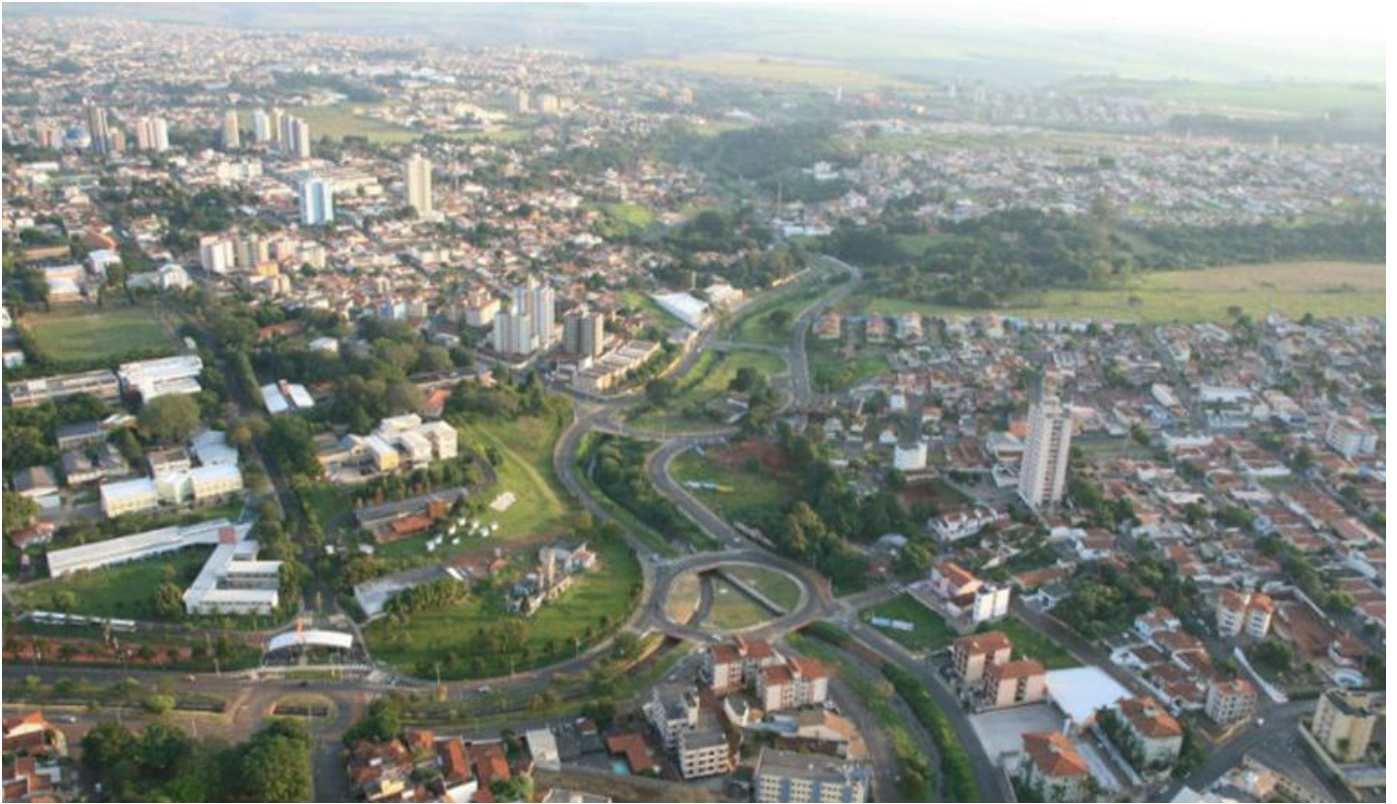
Views of São Carlos, Brazil.