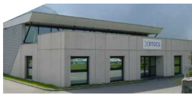
Xenocs in Grenoble, France